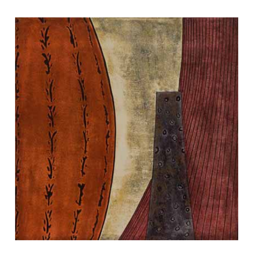
STILL LIFE DETAIL #27 (2009) Pastel and acrylic paint on canvas on plywood 90 x 90 cm $15,000