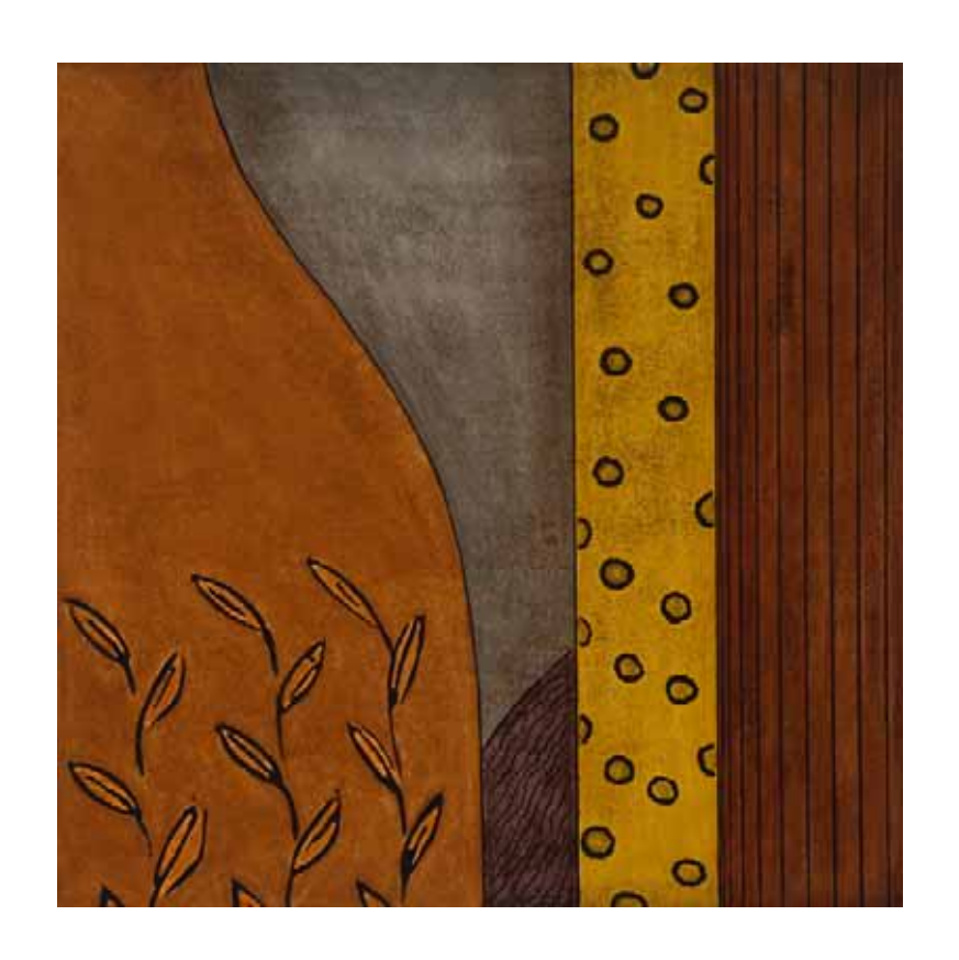
STILL LIFE DETAIL #30 (2009) Pastel and acrylic paint on canvas on plywood 90 x 90 cm $15,000