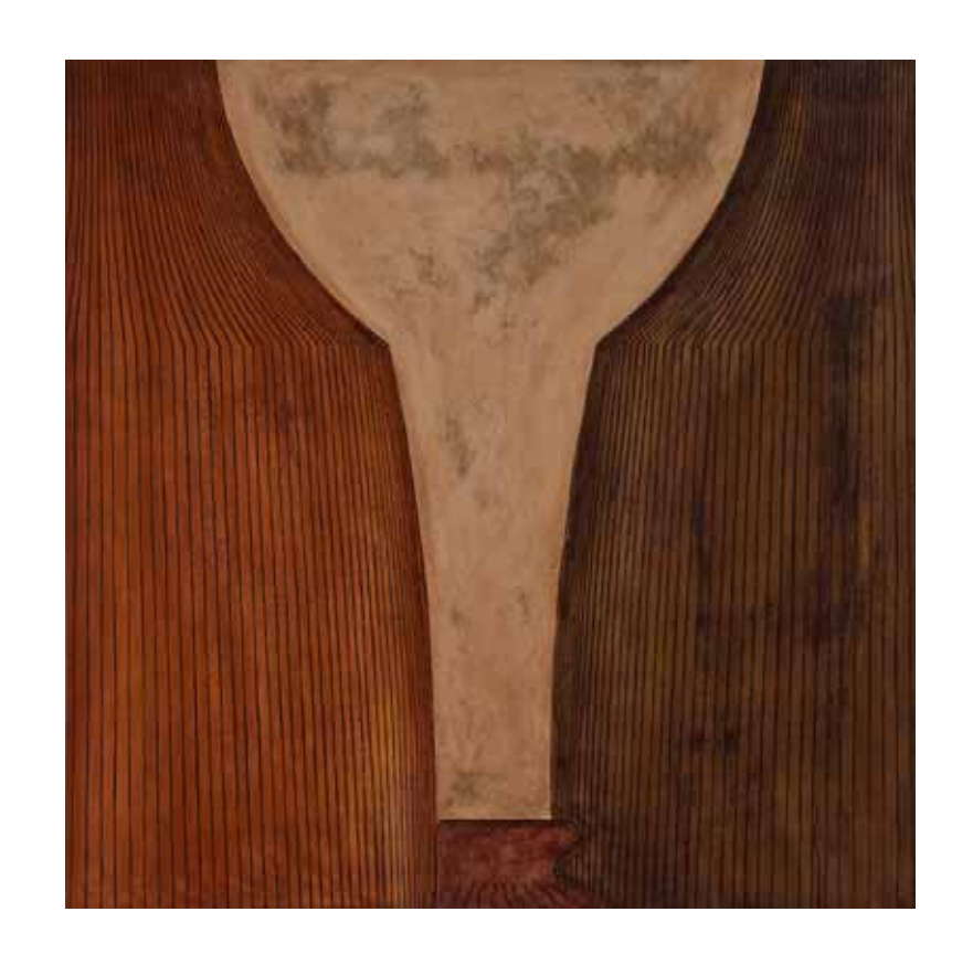
STILL LIFE DETAIL #37 (2009) Pastel and acrylic paint on canvas on plywood 90 x 90 cm $15,000