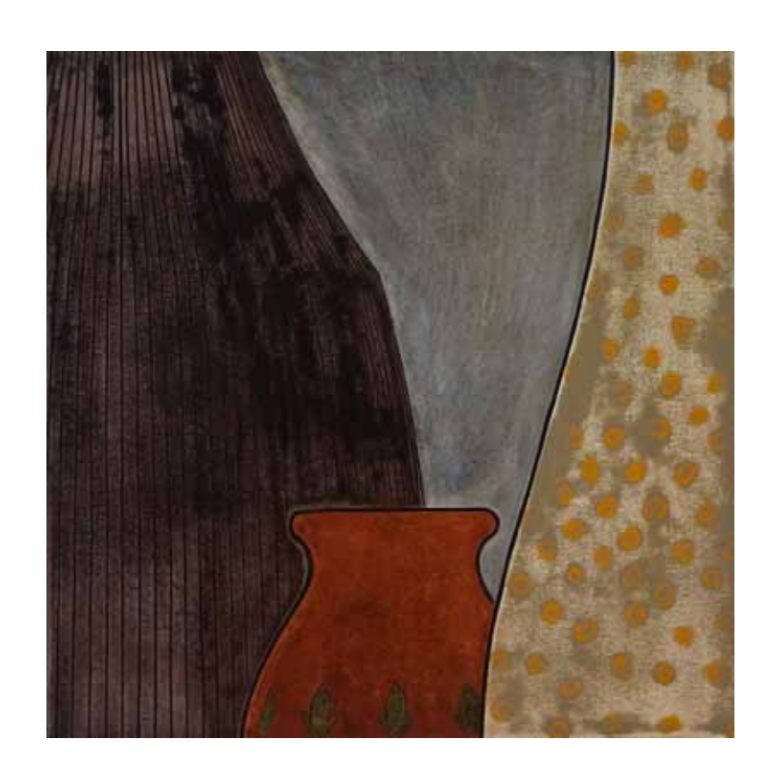
STILL LIFE DETAIL #33 (2009) Pastel and acrylic paint on canvas on plywood 90 x 90 cm $15,000