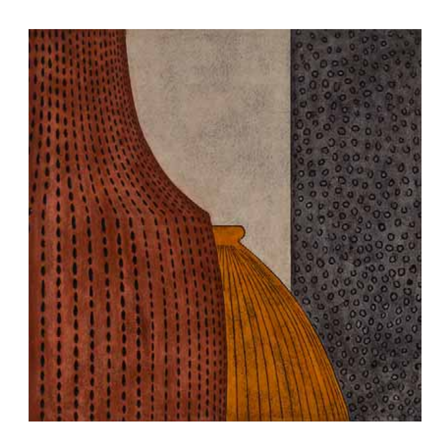
STILL LIFE DETAIL #38 (2009) Pastel and acrylic paint on canvas on plywood 90 x 90 cm $15,000