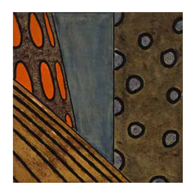
STILL LIFE DETAIL #43 (2009) Pastel and acrylic paint on canvas on plywood 60 x 60 cm $7,500