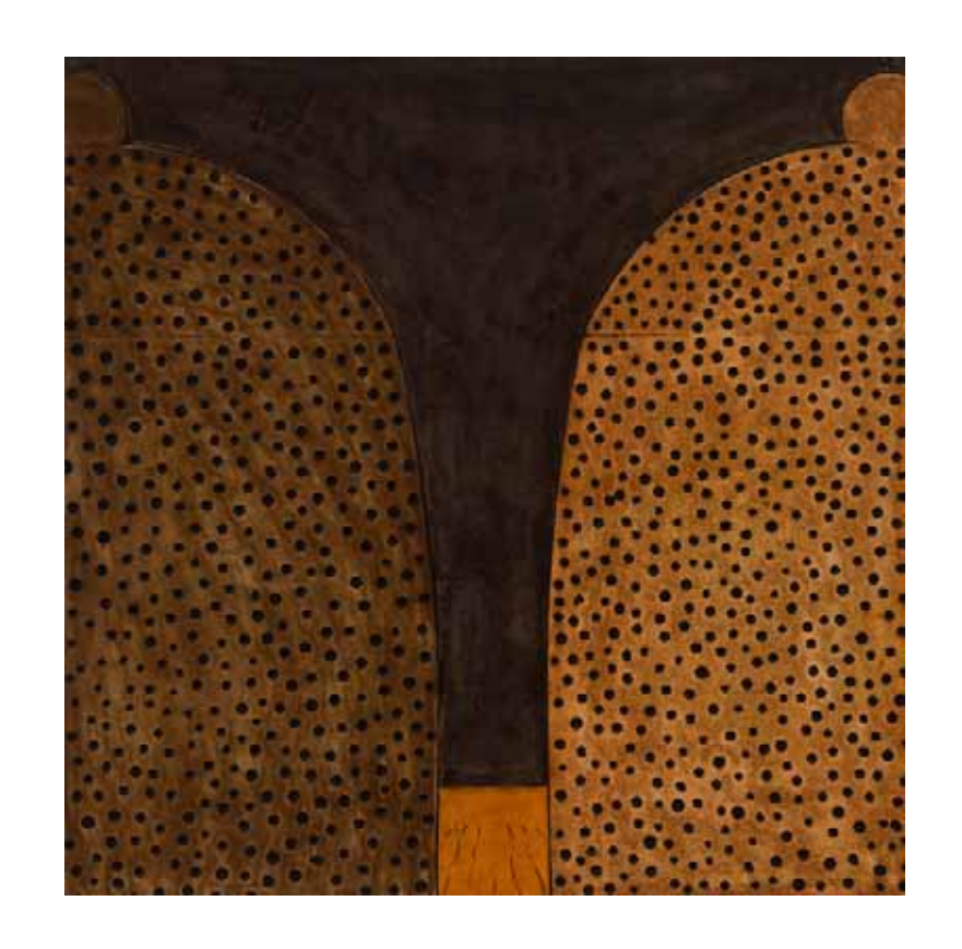
STILL LIFE DETAIL #39 (2009) Pastel and acrylic paint on canvas on plywood 90 x 90 cm $15,000