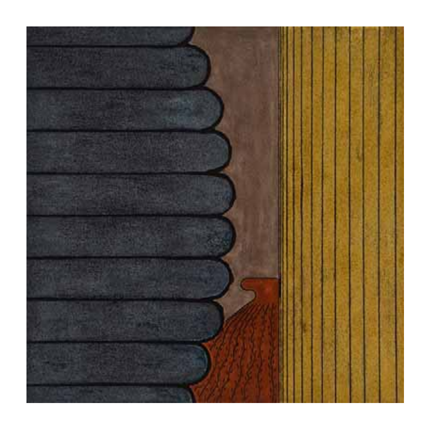
STILL LIFE DETAIL #26 (2009) Pastel and acrylic paint on canvas on plywood 90 x 90 cm $15,000