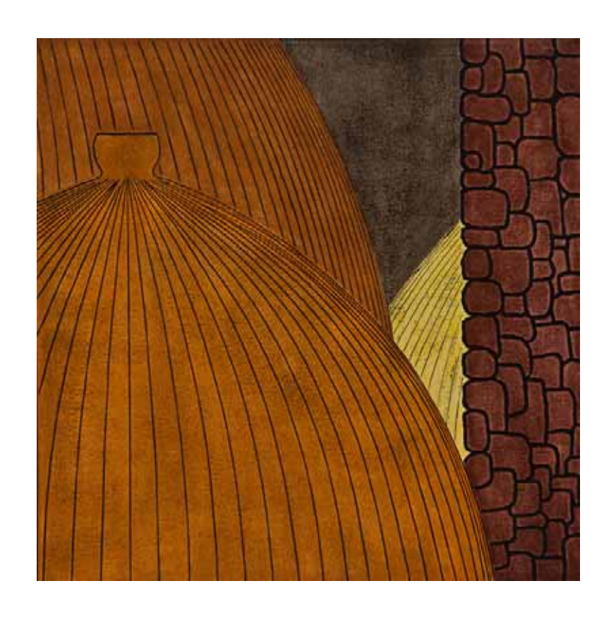
STILL LIFE DETAIL #32 (2009) Pastel and acrylic paint on canvas on plywood 90 x 90 cm $15,000