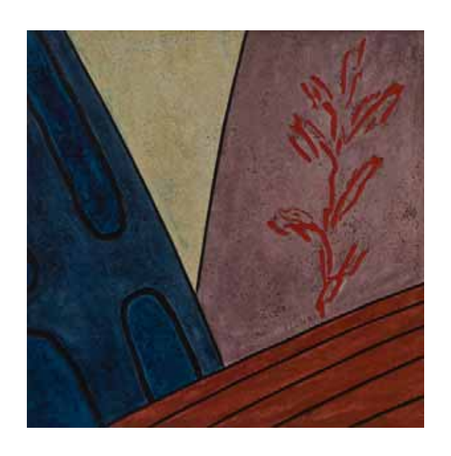
STILL LIFE DETAIL #45 (2009) Pastel and acrylic paint on canvas on plywood 60 x 60 cm $7,500