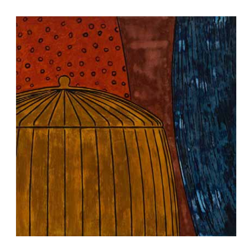
STILL LIFE DETAIL #31 (2009) Pastel and acrylic paint on canvas on plywood 90 x 90 cm $15,000