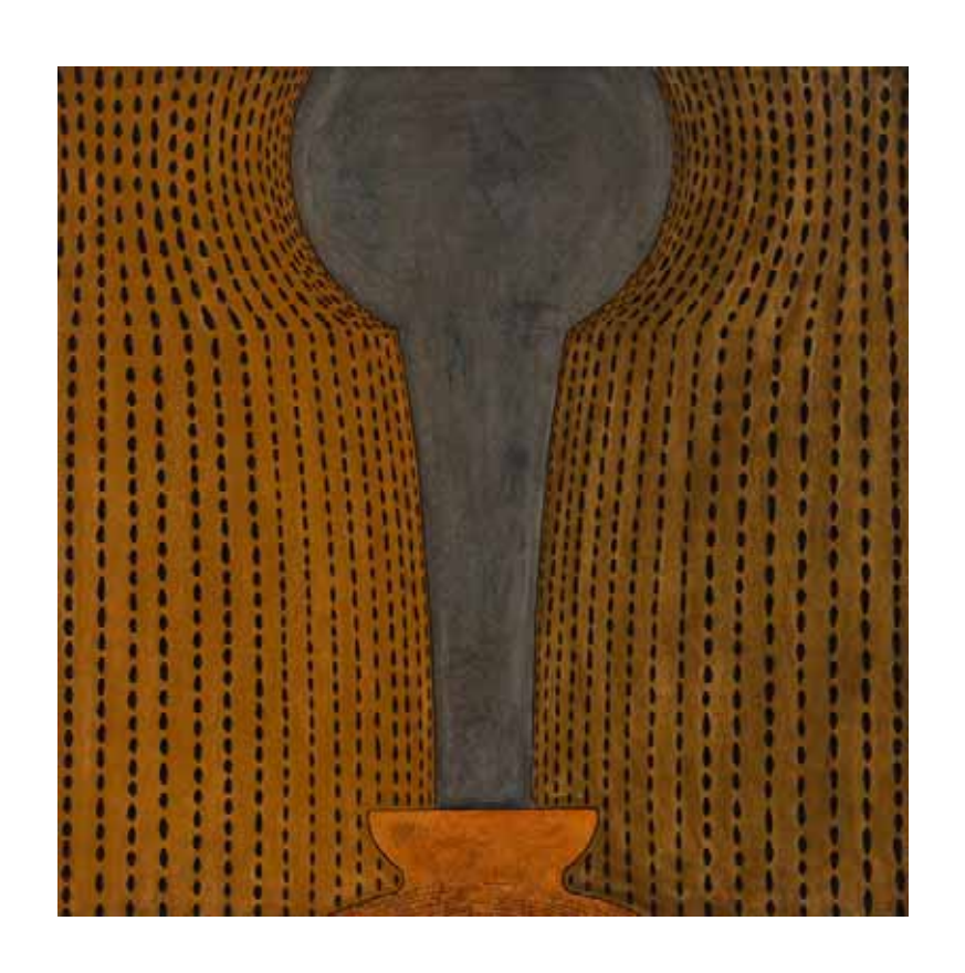
STILL LIFE DETAIL #36 (2009) Pastel and acrylic paint on canvas on plywood 90 x 90 cm $15,000